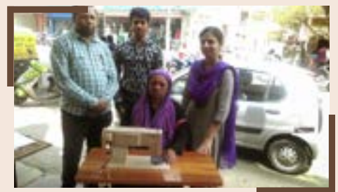
First Beneficiary : Dec 2013