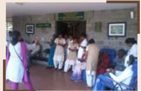
First Shakit Smaran Divas: Mar 2014