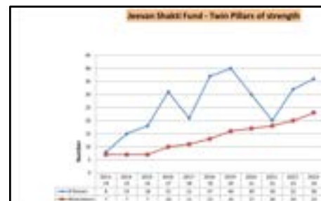
No of Donors and Active Volunteers - 2 pillars of strength

From the 8 donors who seeded Jeevan Shakti Fund in its first year of operations, it's donor base has grown over 14-fold to 108 over these 10 years, with a total collection of ~ Rs. 85 lakhs during this period. This manifold increase of the donor base has been both steady and gradual, and it is very heartening to note that every year, 8-10 new donors have come forward to support the work of this initiative through their kind donations.