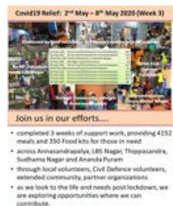
Support During COVID

During the difficult period of the COVID pandemic, Mitra Foundation expanded its activities in response to the needs of the time. During the difficult period of the first COVID wave in 2020, we collaborated with some of the community volunteers who had taken up cooking food daily and distributing to those in need, by collecting monetary contributions and procuring provisions for the purpose. In all we supported over 4000 meals in the 3 weeks when we purchased groceries for these meals. We also sourced and distributed 350 food kits to those in need, in collaboration with the local community leaders and volunteers in adjacent localities. During the 2nd COVID wave, we got in touch with the Nodal officer for Isolation of our zone to understand the help needed.