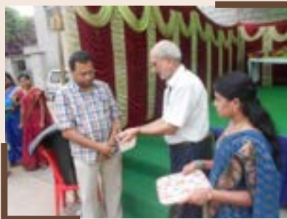
Mitra Foundation getting appreciation from Karunashraya