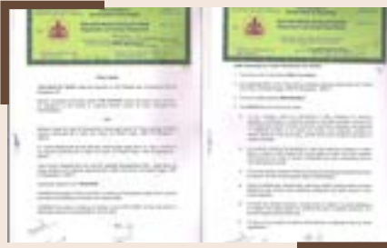
Mitra Foundation Registered: Nov 2013