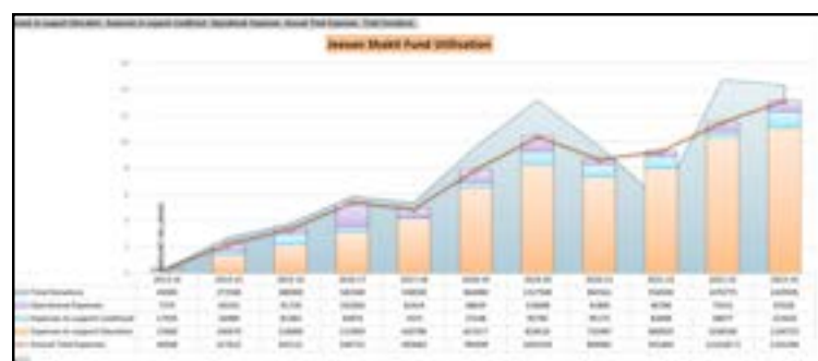
Fund Disbursement Over the years