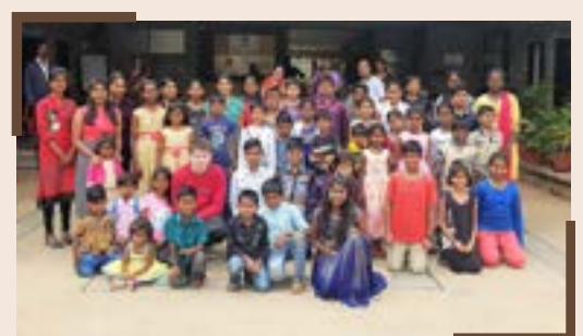
Young Members of Jeevan Shakti Family