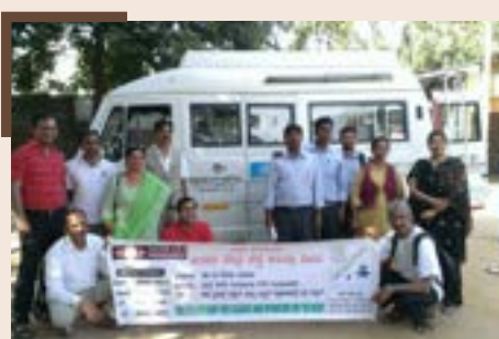
Eye Camp - JanSahayog