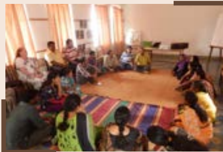
First Jeevan Shakti Manch : 2014