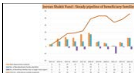
Beneficiary Families supported: (Per year and total)

The success of Jeevan Shakti Fund finally stems from the number of families that become self-sufficient and do not need financial assistance anymore. Over these 10 years, 34 families have become self-sufficient, making it the most satisfying part of this 10-year journey.